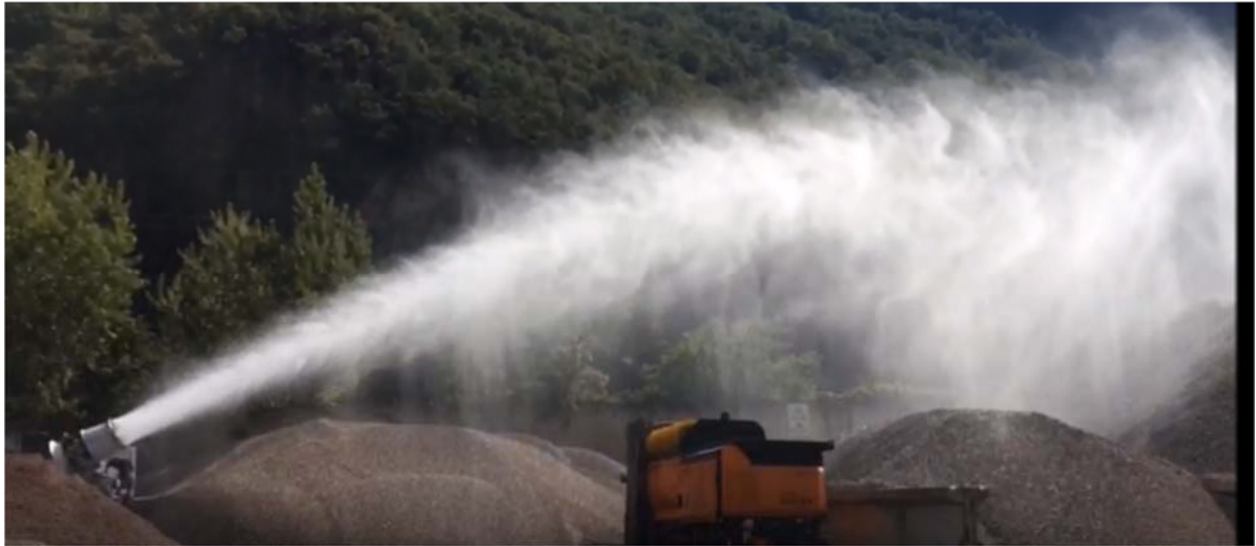
V22 MISTING CANNON