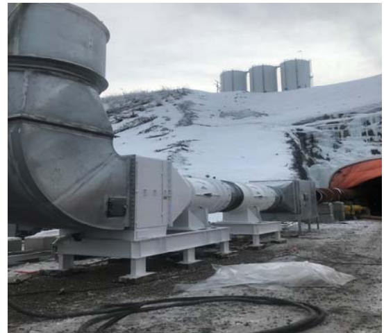
ENGLO TYPE 46 MINING TUNNEL VENTILATION SYSTEM

The largest application of Engart technology has been for handling combustible coal dust at power plants and mines. These installations operate at applications including conveyor transfers, tripper rooms, crusher buildings and reclaim tunnels.