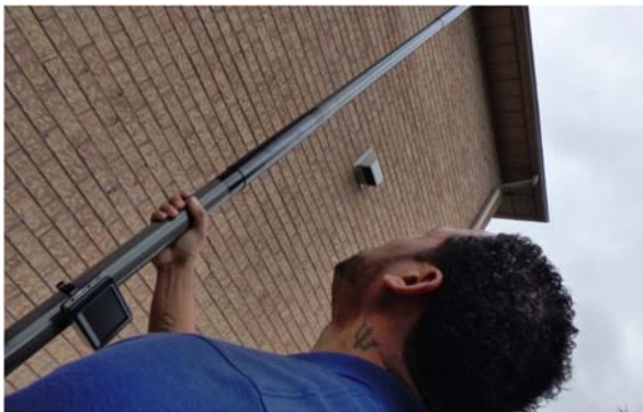
SPACEVAC EXTERIOR HIGH-LEVEL VACUUM TOOLS

Unique hose adapter, anti-static vacuum hose and AX brushes, carbon conductive interlocking ATEX lightweight poles and our unique Safety Locking Mechanism for total operator safety during operation.