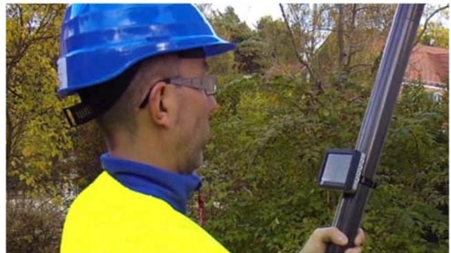
POLE MOUNTED VIDEO CAMERA AND MONITOR PERMIT VIEWING OF WORK