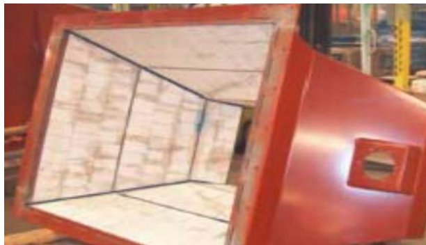
CERAMIC LINED COAL TRANSFER CHUTE

ADI Air Dynamics Industries, an Englo Inc. affiliated company, designs, builds and installs custom metal fabrications and process ventilation ductwork for heavy industrial and mining operations.