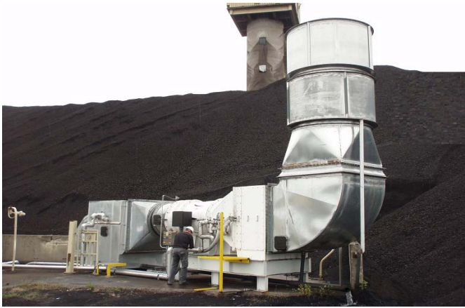
ENGLO TYPE 46 DUST EXTRACTOR COAL RECLAIM TUNNEL