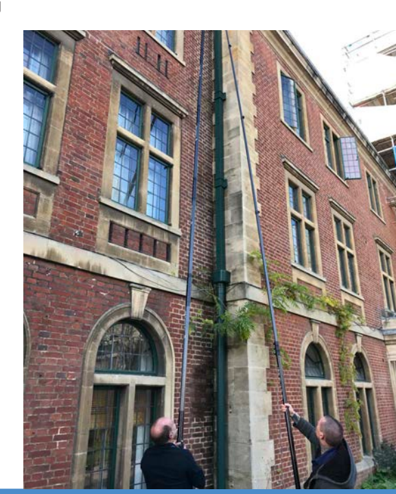
: The World's Leading High-Level Cleaning System

As if all of this innovation wasn't enough, all of SpaceVac's cleaning poles, heads, brushes and tools feature our unique safety locking mechanism for total operator safety. Designed to ensure the system does not separate during operation - this development is just the latest innovation in the development of SpaceVac.